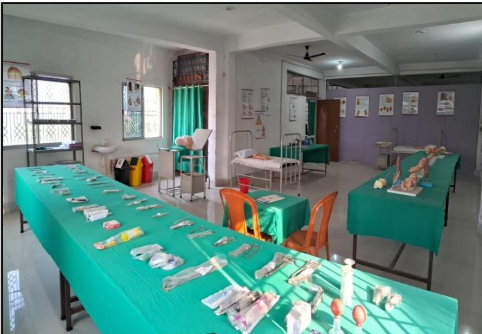
Obstetric and Child Health lab